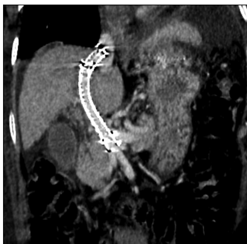
Fig. 3 Follow-up at 1 year showing patent stent with PSV of 140 cm/s on ultrasonography doppler. Contrast-enhanced computed tomography shows wall-to-wall opacification of mesocaval shunt.

A 49-year-old male patient with Nonalcoholic Steatohepatitis (NASH)-related cirrhosis, and multiple episodes of hematemesis in the past 1 year had undergone endoscopic variceal ligation. Multiphasic CT scan showed changes of cirrhosis with PVT (Yerdel's grade III), multiple esophageal and gastric varices, and lienorenal shunt. The patient was referred to the intervention radiology department for TIPS in view of refractory UGI bleeding and malena. Extended TIPS/mesocaval shunt was done with antegrade plug assisted embolization of the large gastric varices with N-butyl cyanoacrylate. In a similar manner as described above, postprocedure follow-up on day 1, day 3, day 28, and day 60 and 6 months reveal patent shunt with no recurrent episodes of UGI bleeding. Patient is on follow up.