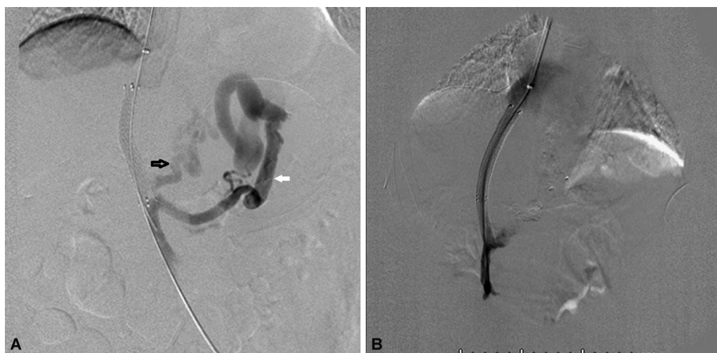
Fig. 2 (A) Venogram after placement of covered stent covering left gastric vein (LGV) (black arrow) showed persistent hepatofungal flow and opacification of gastroesophageal varices via LGV and posterior gastric vein (arrows). (B) Venogram post coil embolization and mesocaval shunt placement showing hepatopetal flow with opacification of shunt.

class B, and MELD score of 10. Contrast-enhanced CT scan showed changes of cirrhosis with PVT, multiple esophageal and gastric varices, and a lienorenal shunt. The patient was referred to the intervention radiology department for TIPS because of recurrent UGI bleeding. Right IJV was punctured under ultrasound guidance and 10 Fr TIPS sheath was inserted into the right hepatic vein. Using similar technique access to the main PV was gained through hepatic parenchyma under ultrasonography (USG) guidance. Portal venogram showed complete thrombus of main PV (Yerdel's grade III) with extension into SMV with shunting of blood to gastrorenal shunt. The covered stent (10mm) was deployed followed by antegrade plug and coil-assisted embolization of the large gastric varices with N-butyl cyanoacrylate. PV balloon venoplasty was done; however, clot remained adherent with poor flow seen across the TIPS, following which another uncovered stent was placed extending from proxi-