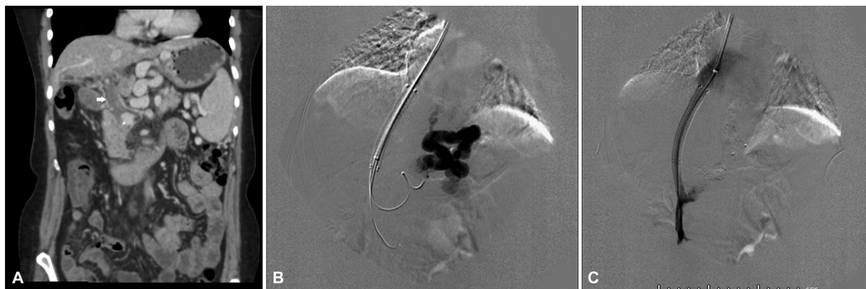
Fig. 4 (A) Contrast-enhanced computed tomography shows complete portal vein thrombosis. (B) Covered stent placement extending from hepatic vein–inferior vena cava junction to main portal vein with antegrade coil and plug embolization of varices. (C) Overlapping uncovered stent placement extending to create mesocaval shunt.

feasible option for these patients. However, PVR TIPS has been defined as deployment of short length TIPS stent that does not cover the main PV as defined by Salem et al. 9 In instances where the flow through main PV is not well established, stent needs to be extended into SMV or splenic vein depending upon the extent of thrombus.