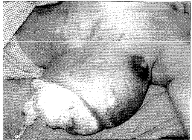
Figure 1: Photograph of the patient in the supine position demonstrating the huge size, the large size of the ulcer and the tumour tissue which is seen sloughing off.