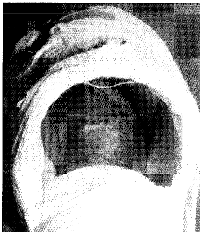
Figure 1: POP mold over the heel with the patient prone showing the flap and SSG over the pedicle

The method described to protect the pedicle of flaps to cover the posterior area in a heel defect is by no means simple as it is an invasive method, requires extra instrumentation and Ilizarov rings, which may not always be available in a plastic surgery unit. I have for long been using a simple plaster of Paris cast mould of about 16 to 20 layers roofed over an anterior cast. This not only effectively immobilises the limb and ankle, it also keeps off any pressure from the flap and the pedicle. (Figure 1 and 2)