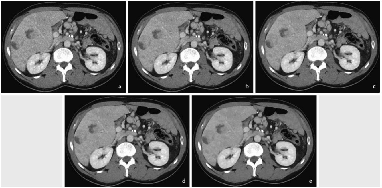
► Fig. 4 CT examination of a patient with hepatic and lymphogenous metastasized neuroendocrine tumor of the pancreas as example for the altered image impression with iterative reconstruction. Images were reconstructed using ADMIRE (Advanced Modeled Iterative Reconstruction, Siemens Healthineers) in five ascending degrees of iteration with window width of 350 HU and centre of 50 HU. By decreasing image noise, homogenous areas as the liver parenchyma show lower contrast while the stranding of the perirenal adipose tissue looks more and more blurred when using high degrees of ADMIRE (a ADMIRE 1, b ADMIRE 2, c ADMIRE 3, d ADMIRE 4 and e ADMIRE 5).

lation can be useful since it allows retrospectively dose-reduced CT data by simulating CT examinations with reduced tube current by adding realistic image noise to existing original data [62]. This is being increasingly employed, for example in developing a cranial low-dose CT perfusion protocol [22, 23, 63, 64]. It was demonstrated that a dose reduction of up to 60 % of the original standard dose does not result in image quality deterioration or diagnostic accuracy using this method.