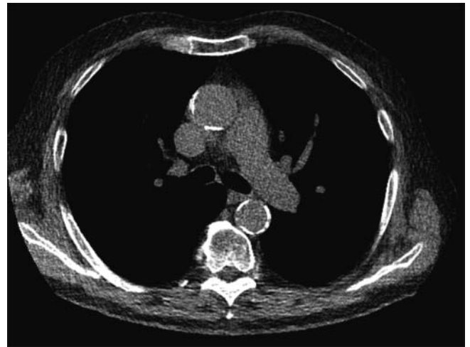
► Fig. 1 Low-dose CT of a patient before surgical replacement of the aortic valve for depiction of aortic calcifications; these are well evaluable, as well as the aortic diameter ( CTDI_{vol} 0.42 mGy, DLP 14.1 mGy*cm). The examination was performed using a Siemens SOMATOM Force.

Table positioning plays a major role here, since automatic modulation of tube current and voltage (see following sections) is based on the attenuation profile of the patient derived from the planning image. Positioning not centered on the middle of the body simulates a too large or small patient diameter due to the changed distance to the tube and detector and may be accompanied by excessive or low radiation exposure, which also affects the image quality (► Fig. 2 ) [39–41]. A study of an anthropomorphic thoracic phantom revealed a deviation of the radiation dose of -23 and +38 percent, respectively, when using a p. a. planning image for a table shifted 6 cm higher or lower than the correctly centered table position. In addition, it was shown that in clinical practice many CT examinations are carried out at a table height that is too low and therefore involve an unnecessarily high radiation exposure [40]. Correspondingly, to control proper cen-