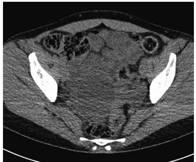
► Fig. 2 CT-examination of a female patient with suspected renal colic on the right side using automatic exposure control. Due to the not correctly centered examination table, the examination was performed with inadequate low radiation dose ( CTDI_{vol} 1.7 mGy, average CTDI_{vol} at this scanner for this objective 3.4 mGy) resulting in high image noise despite using iterative reconstruction (ADMIRE 2). Therefore, the image quality was considered insufficient to detect small ureteral calculi.

tering, if necessary, an additional lateral planning image should be produced which allows the evaluation of table height [42], since the resulting minimal additional radiation dose appears justifiable. Another alternative is to acquire only a lateral planning image; thus, a study of low-dose CT imaging of the thorax demonstrated that this procedure is most efficient with respect to radiation hygiene [43]. It should be noted, however, that a repetition of the planning image may be necessary if faulty table