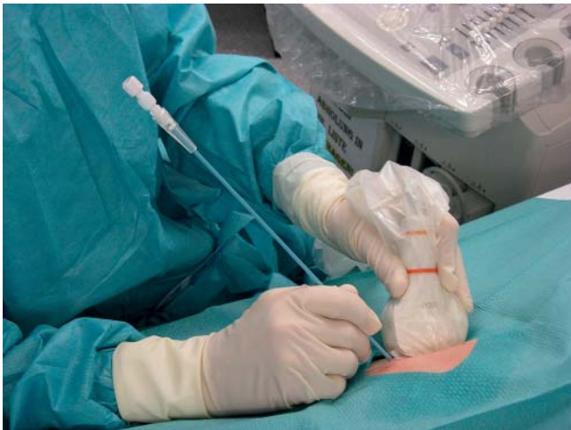
► Fig. 4 Placement of an abscess drainage tube. Ultrasound probe, cable, and keyboard are covered with sterile covers. Following hand disinfection, the examiner is dressed as in a surgical situation. A sterile drape/incise drape serves as the barrier precaution. A sterile ultrasound gel is used as the contact medium. A sterile work table is additionally available.

in the instructions for use. Proof of efficacy with recognized methods must be documented by an expert opinion (...)” [14]. This requirement was included in the ultrasound agreement in 2017 [36].