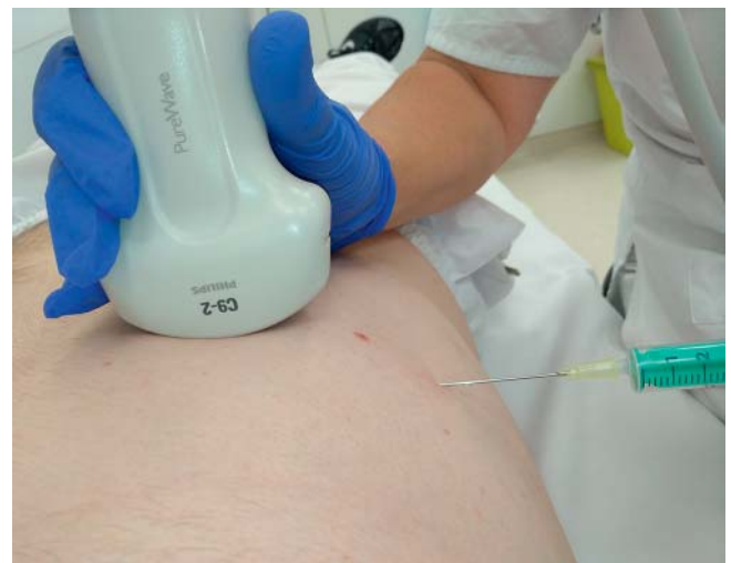
► Fig. 2 A safety distance between the ultrasound probe and the sterile needle is maintained in this freehand biopsy. If the examiner can ensure that the needle will not come into contact with the ultrasound probe, a sterile ultrasound probe cover is not necessary.

after every use is sufficient here. Disinfectants with only bactericidal and yeasticidal (yeast killing) activity are to be used.