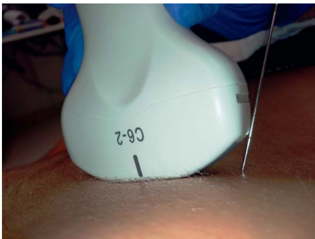
► Fig. 1 Incorrect puncture using the freehand technique with minimal needle distance from the ultrasound probe. The needle unintentionally comes in contact with the ultrasound probe that has only been disinfected. A sterile cover for the ultrasound probe would be needed in this case.