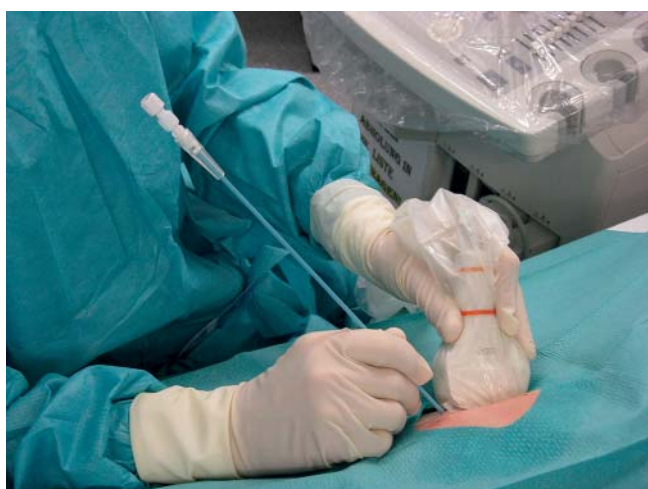
► Fig. 4 Placement of an abscess drainage tube. Ultrasound probe, cable, and keyboard are covered with sterile covers. Following hand disinfection, the examiner is dressed as in a surgical situation. A sterile drape/incise drape serves as the barrier precaution. A sterile ultrasound gel is used as the contact medium. A sterile work table is additionally available.

in the instructions for use. Proof of efficacy with recognized methods must be documented by an expert opinion (...)” [14]. This requirement was included in the ultrasound agreement in 2017 [36].