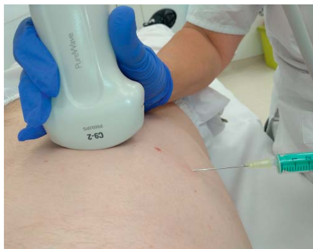
► Fig. 2 A safety distance between the ultrasound probe and the sterile needle is maintained in this freehand biopsy. If the examiner can ensure that the needle will not come into contact with the ultrasound probe, a sterile ultrasound probe cover is not necessary.

after every use is sufficient here. Disinfectants with only bactericidal and yeasticidal (yeast killing) activity are to be used.