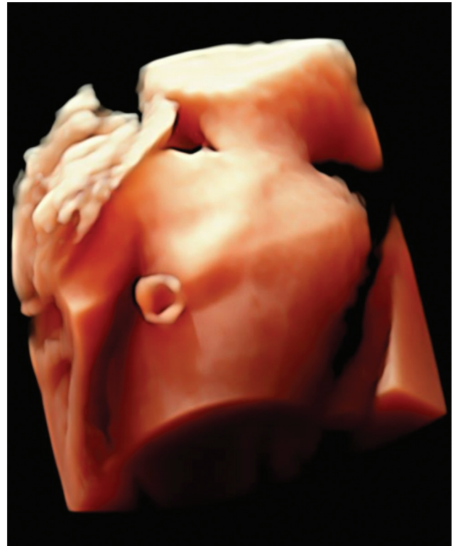
Fig. 4 Shunt in situ.

1. Document no free fluid in maternal flanks by ultrasound immediately at the end of the procedure and 3 hours postprocedure