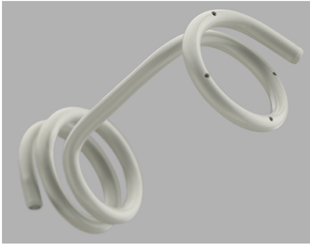
Fig. 1 Harrison fetal bladder stent.