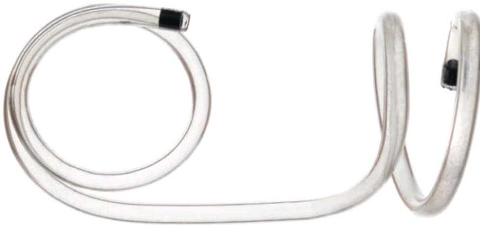
Fig. 2 KCH-rocket fetal bladder stent.

Trendelenburg position, and external version of the fetus may all be employed as necessary to manipulate the fetus into a reasonable position.