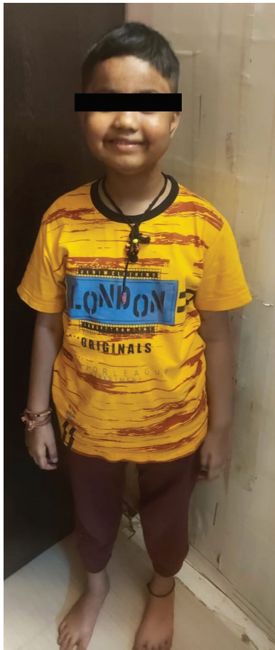
Fig. 4 Postoperative 4 months of surgery, with resolution of moon face and weight loss.

differentiate between a benign adrenal adenoma and ACC, but there are features that might favor ACC, 16 like tumor size more than 4 cm; irregular margins; heterogeneous intensity due to hemorrhage, necrosis, and fibrosis; calcifications 17 attenuation more than 10 Hounsfield unit (HU); and less than 50% contrast washout. Our patient had a tumor diameter of 6 to 7 cm, which favors adrenal carcinoma.