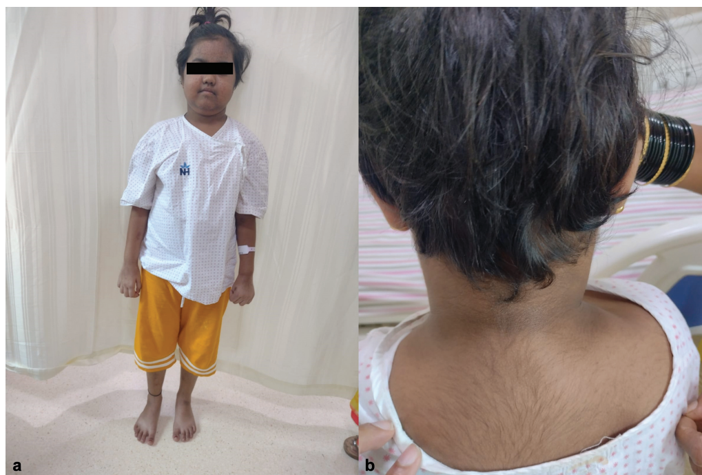
Fig. 1 (a) Clinical image of child central obesity, facial plethora with typical moon face. (b) acanthosis nigricans, and hirsutism.

There was no history of steroid drug use. She had marked central obesity, facial plethora with typical moon face, acanthosis nigricans, and increased body hair. She also had pitting edema with distended abdomen without hepatosplenomegaly. Her height was 108 cm (height z score, 1.14), weight 34 kg (z score, 2.45), with body mass index (BMI) of 29.15 (z score, 3.82). Initially, child was admitted in intensive care unit and started on injection labetalol infusion followed by three antihypertensive medicines, viz., prazosin, atenolol, and nifedipine.