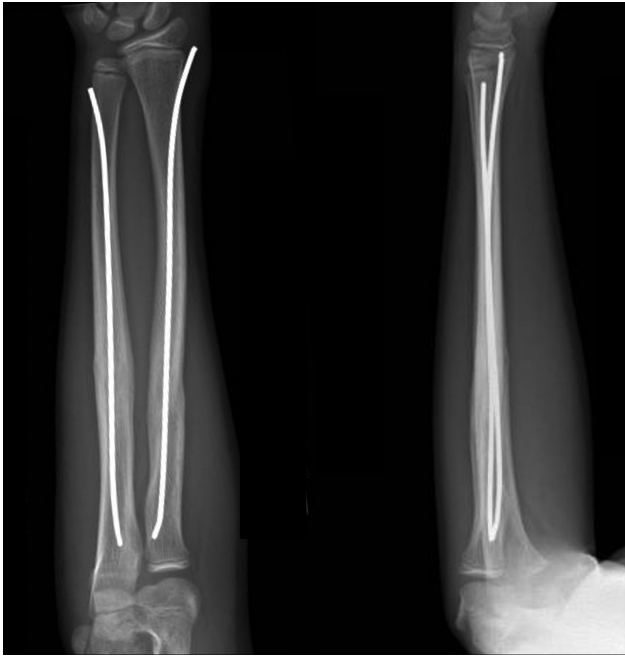
Fig. 2 Anteroposterior and lateral radiograph at 6 months follow-up.