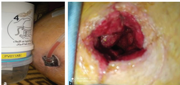
Fig. 2 (a) PragmaVAC device and pump. (b) Wound after PragmaVAC device removal.

Due to the diagnosis of a likely hydatid subcutaneous cyst, the patient had a chest X-ray, which was unremarkable, and then went on to have an ultrasound and then computed tomography (CT) scan of her liver; this revealed the presence of an active solitary hydatid cyst without daughter cysts in the liver of 7.5 cm ( Fig. 4a ). This was treated with PAIR with adjunctive albendazole 400 mg twice daily for 3 months as per the WHO standard guidance for stage CE3a for a cyst greater than 5 cm. 4,5 An ultrasound of the gluteal area was performed