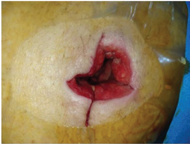
Fig. 1 Gluteal hydatid disease cavity postsurgery.

smoke or drink. She took no regular medication and had no known drug allergies. On physical examination, there was a swelling in the upper lateral quadrant of the right gluteal region with signs of erythema, tenderness, and warmth. Abdominal, chest, and neurologic examinations were normal.