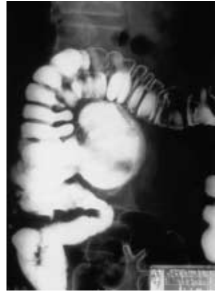
Figure 2 Barium enema examination shows a solitary giant diverticulum of the ascending colon, approximately 9 × 7 cm in diameter.

Figure 1 We report a rare case of a patient with a giant diverticulum of the ascending colon who presented with lower gastrointestinal bleeding. Giant diverticulum of the ascending colon is a rare complication of diverticular disease. To our knowledge, this is the first reported case of a wide-base giant diverticulum of the ascending colon complicating lower gastrointestinal bleeding. This is also the first report of the application of colonoscopy in the initial diagnosis of giant colonic diverticulum. The colonoscopic study shows the giant diverticulum with a wide-base opening, measuring 3 cm in diameter (arrowheads).