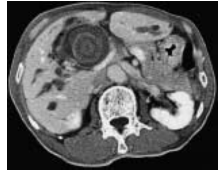
Figure 2 Computed tomography of the abdomen showed a giant, stratified calculus in the common bile duct, as well as the dilated intrahepatic bile ducts. The stone in the common bile duct was measured at 5 × 5 cm. The stone was removed by laparotomy.