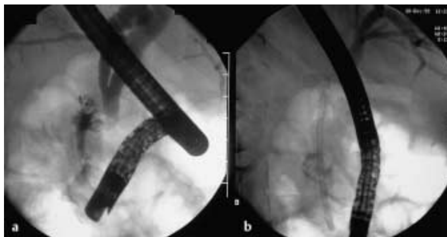
Figure 2 Radiography showing a duodenal diverticulum (a) and stenting of the common bile duct (b)