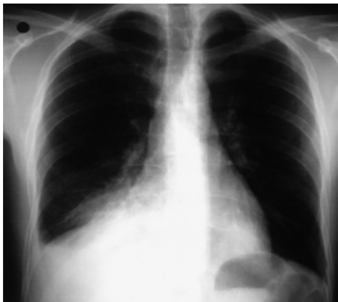
Fig. 1 Posterioranterior chest radiograph shows right middle and lower lobe infiltrates and accompanying ipsilateral effusion caused by accidental aspiration of a liquid hydrocarbon mixture.