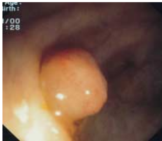
Figure 1 An 81-year-old man presenting with general weakness and anemia, underwent colonoscopy because of a positive hemocult test. During the examination, several small, sometimes centrally eroded polyps, measuring 6–8 mm in diameter, were found.