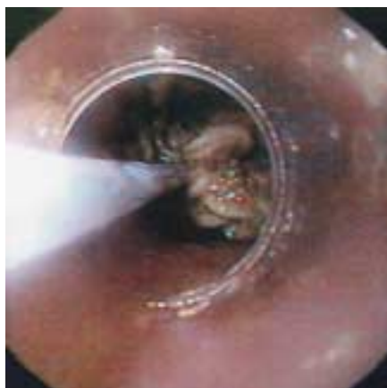
Figure 2 The meat bolus has been grasped with the basket. The endoscope with the suction cup is advanced towards the meat bolus impaction while the Dormia basket grasping the bolus is carefully pulled towards the endoscope.