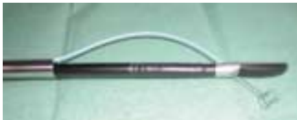
Figure 1 External view of the "armed" laparoscopic ultrasound probe, with the radiofrequency needle expanded into a spiral shape outside the operating channel.

Radiofrequency (RF) in-situ tissue ablation has expanded the indications for curative therapy for nodular hepatocellular carcinoma (HCC) and liver metastasis from colon cancer. Due to rapid innovations, the balance between the risks and benefits of the various techniques has not yet been clarified in relation to the percutaneous, laparoscopic, and laparotomy approaches [1]. Published reports on laparoscopic ultrasound-guided radiofrequency (LUS-RF) tumor ablation have suggested potential benefits: reduced risk in difficult percutaneous approaches (hemoperitoneum, intestinal perforation, pleural complications), an opportunity for better staging [2] and simultaneous treatment of incidental nodules, the ability to switch to LUS-RF therapy after a previously planned surgical resection, and combination therapy in patients with multifocal disease. In LUS-RF, inser-