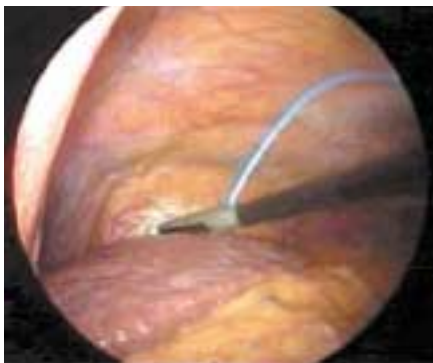
Figure 2 Laparoscopic view. The laparoscopic ultrasound probe is in contact with segment II of the left lobe of the liver. The blue catheter is "armed" with the radiofrequency needle.

tion of the needle-electrode is usually carried out freehand through the abdominal or intercostal wall, and the needle tip is then directed under visualization on the laparoscopy monitor to the vicinity of the ultrasound transducer in contact with the liver surface. Correct placement of the needle in the lesion is assisted and monitored on the ultrasound screen. Access to some liver segments therefore requires mobilization of the liver itself, after resection of the right or falciform ligaments to allow the required direct laparoscopic visual control [3]. We present here a new fine-needle (1-mm) instrument containing an expandable spiral electrode with a cylindrical shape, which is capable of ablating lesions up to 2.5 cm in diameter (Invatec, Italy). With this instrument, laparoscopy is carried out with the patient under conventional general anesthesia, and two ports are used – one for the laparoscope and one for the ultrasound probe. The LUS flexible probe (8666, B-K Medical, Denmark) is mounted on a biopsy system in which a 2-mm catheter is placed coaxially to the probe itself and screwed into the operating channel at the end of the transducer Figure 1. The probe enters the port under laparoscopic control, and upward movement allows straightening of the catheter angle with the operating channel. The fine-needle electrode is now pushed inside the catheter as far as the end of the probe's operating channel. This "armed" probe, with the