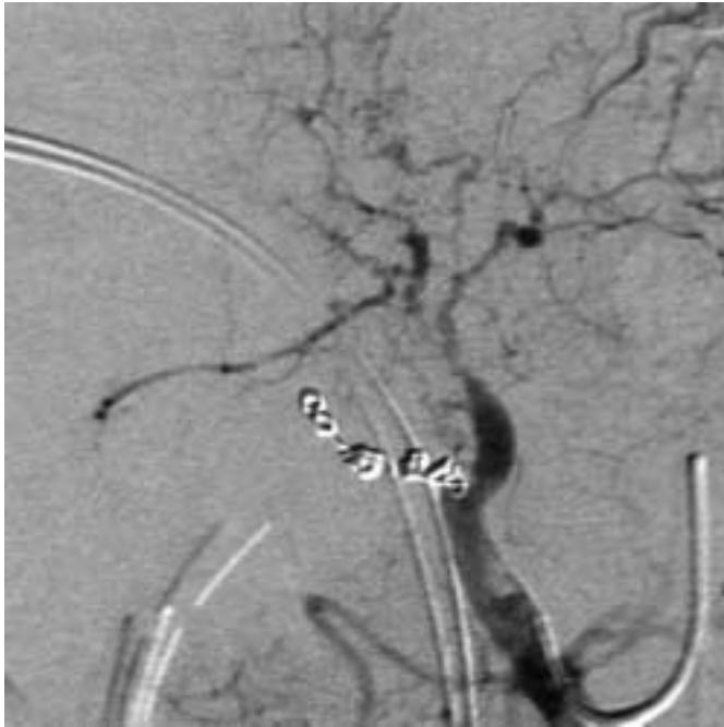
Figure 3 Successful implantation of microcoils.