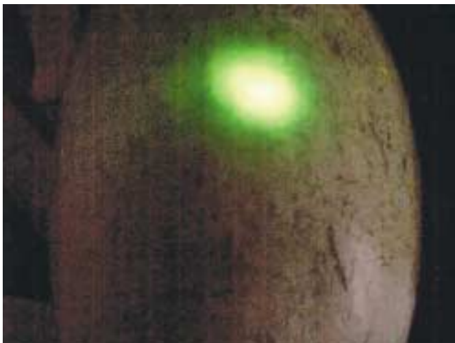
Figure 3 The watermelon is transilluminated using an ordinary gastroscope.