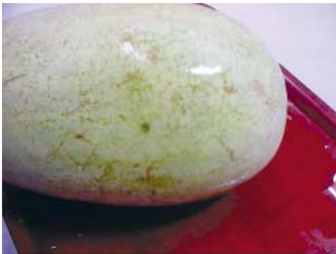
Figure 1 A good-sized watermelon is used.