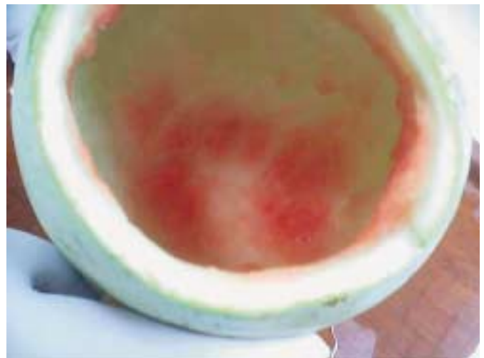
Figure 2 One end of the watermelon is cut and the inside is cuffed.