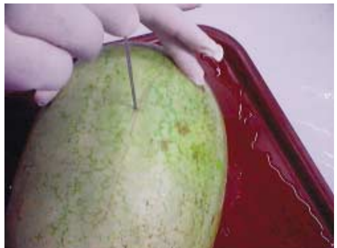
Figure 4 An equipment set for percutaneous gastrostomy by the thread pull-through method is used (GIP Medizintechnik GmbH, E-mail: gip@gip-med.de). The trocar is passed through the transilluminated area.