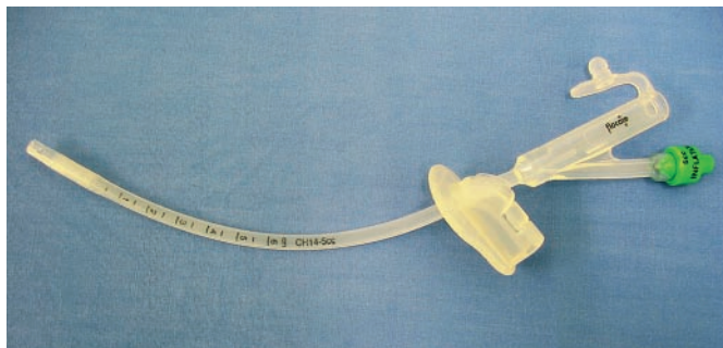
Figure 1 A gastrostomy tube on its own is quite flexible.