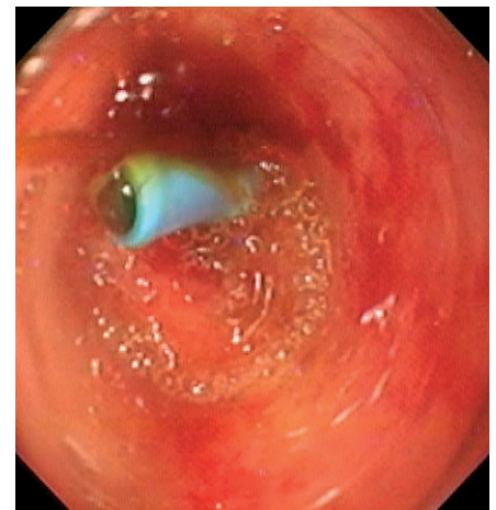
Figure 2 A biliary stent was inserted after successful cannulation of the bile duct.

Department of Medicine and Therapeutics The Chinese University of Hong Kong Prince of Wales Hospital Shatin N.T. Hong Kong SAR China Fax: +852-2637-5396 E-mail: leeytong@cuhk.edu.hk