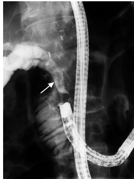
Figure 2 Fluoroscopic view of stone extraction using a conventional basket catheter after endoscopic papillary balloon dilation in patient 1. The arrow points to the common bile duct stones caught in the basket catheter.