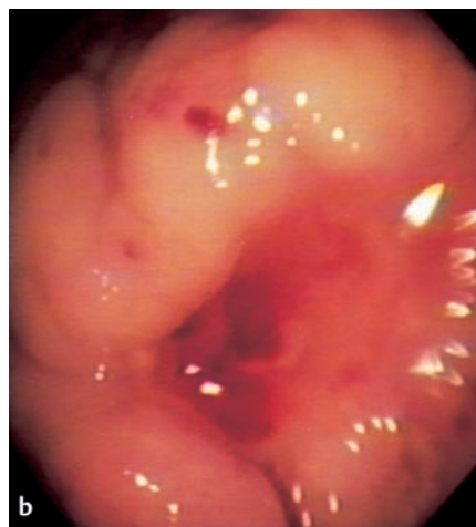
Figure 1 a Esophagogastroscope revealed a gastric ulcer on the posterior wall of the stomach, just opposite the tip of the gastrostomy tube. A bleeding vessel is seen at the base of the ulcer. Effective endoscopic hemostasis is technically difficult due to the tangential viewing of the ulcer with this approach. b Upper endoscopy via the gastrostomy site provides an end-on view of the bleeding gastric ulcer. Effective endoscopic hemostasis can be achieved with ease.

case the patient was not offered surgery, as we believe that endoscopy via the gastrostomy site is capable of providing end-on visualization of the ulcer for effective hemostasis.