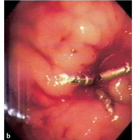
Figure 2 a Successful hemostasis of the bleeding gastric ulcer is achieved after epinephrine injection and the application of four Hemoclips. b On the following day, a fourth endoscopy via the gastrostomy route showed no evidence of recurrent ulcer bleeding. The four Hemoclips were still firmly attached to the base of the ulcer.

the stomach via the PEG site. The ulcer was approached with end-on viewing in this position (Figure 1b), and hemostasis was achieved by injecting epinephrine and placing four Hemoclips (Figure 2a). A fourth endoscopic examination via the gastrostomy route the next day showed no evidence of recurrent ulcer bleeding. The four Hemoclips were still firmly attached to the ulcer base (Figure 2b). The patient's PEG tube was reinserted, and he