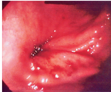
Figure 2 Endoscopic view showing the two Endoclips closing the gastric side of the gastrocutaneous fistula.

This innovative technique for closing gastrocutaneous fistulas using electrocautery (to destroy fibrous tissue), Endoclips (to achieve mechanical closure on the gastric side of the fistula, improving the adherence of the fistula walls and preventing the flow of gastric secretions), and topical skin adhesive (to seal the fistula opening from the abdominal side) may prove useful in other patients suffering from refractory gastrocutaneous fistulas.