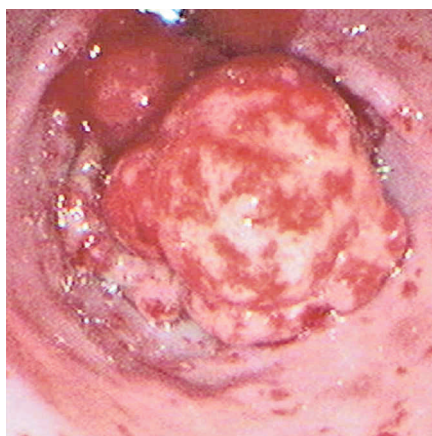
Figure 2 A hyperplastic polyp developed after multiple sessions of argon plasma coagulation.

[4,5] and a case of hyperplastic polyp (DM Chaves, personal communication cited in [1]) have been reported following APC. Even though the development of a hyperplastic polyp more usually occurs after Nd:YAG laser treatment, we must consider this possibility when we observe a polyp after APC treatment in a patient with GAVE.