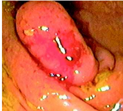
Figure 1 Colonoscopic view showing an intussusception of the appendix.

3 Department of Anesthesiology, Hospital Angeles del Pedregal, Mexico City, Mexico.