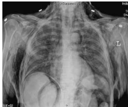
Figure 1 A chest radiograph after the endoscopy showed pneumoperitoneum and pneumomediastinum, with extensive subcutaneous emphysema surrounding the chest wall bilaterally, extending into the neck region.

Subcutaneous emphysema following diagnostic endoscopy, where there is no increased risk of perforation, has been described previously [1,2]. The underlying mechanism is spread of air through deep fascial planes to subcutaneous tissue, and there are two main origins of air leakage. The first is from the alveolar space, due to increased airway pressure after air insufflation [3,4]; the second is from the gastrointestinal tract following mucosal disruption [3], which may occur during endoscopy. In the absence of obvious perforation, patients who develop subcutaneous emphysema typically have a potential site of weakness of the gastrointesti-