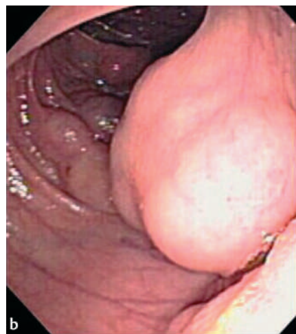
Figure 2 Multiple large, intramural, cyst-like structures were seen at the level of the splenic flexure at colonoscopy.