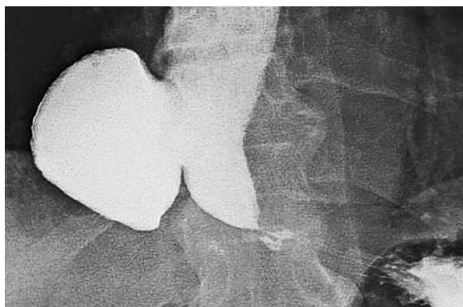
Figure 2 Barium radiograph showing an epiphrenic diverticulum with a "bird's beak" configuration of the distal esophagus.