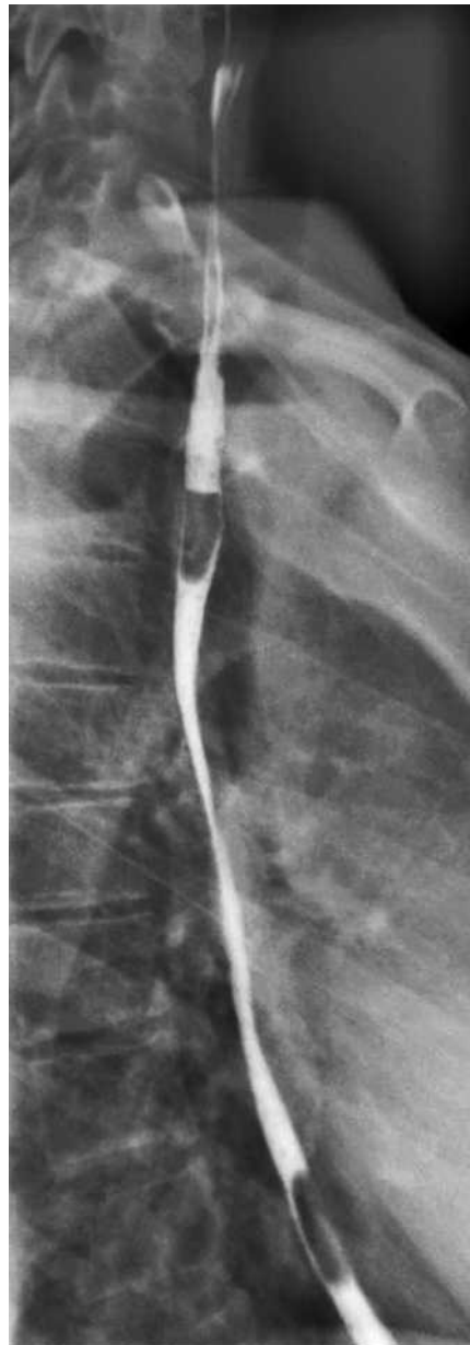
Figure 1 The barium swallow at admission. The extended filiform esophageal stenosis should be noted.

The endoscopic findings in eosinophilic esophagitis most commonly include mucosal fragility, strictures, whitish papules, and a small-caliber esophagus [1]. Eosinophilic esophagitis is best defined by the presence of eosinophils within the epithelium. The presence of more than 15–20 eosinophils per high-powered field is considered to be diagnostic of eosinophilic esophagitis [2,3].