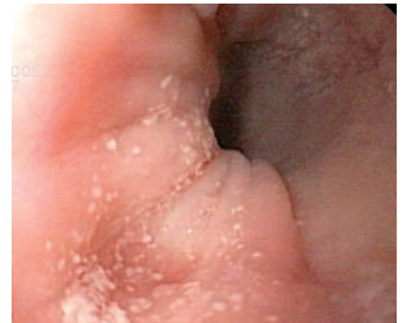
Figure 2 The macroscopic findings at endoscopy. There is no dominant stenosis, but signs of esophagitis and white pin-point plaques were observed.

Perforation of the esophagus occurred following dilation. Dilation treatment should be reserved for patients suffering from dysphagia related to the eosinophilic esophagitis who do not respond to medical therapy. Topical steroid treatment has been shown to be safe and effective [4,5]. The endoscopic findings in eo-