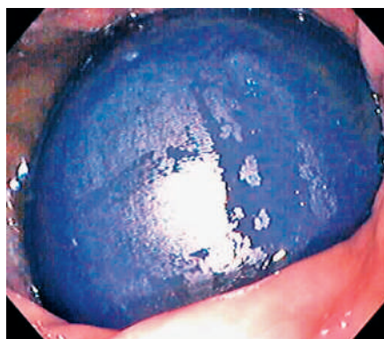
Figure 1 The impacted gastric balloon in the antrum.

A home-made snare was then devised that was large enough to surround a section of the balloon and allow it to be withdrawn. The snare was created by folding in half a 0.035-inch endoscopic retrograde cholangiopancreatography (ERCP) guide wire. The ends of the wire were threaded through the plastic sheath of an injector needle, with the loose ends of the wire being held in place with an alligator clamp. The wire loop was withdrawn into the sheath, and the sheath was passed blindly into the stomach, like an orogastric tube. A rat-toothed forceps was then