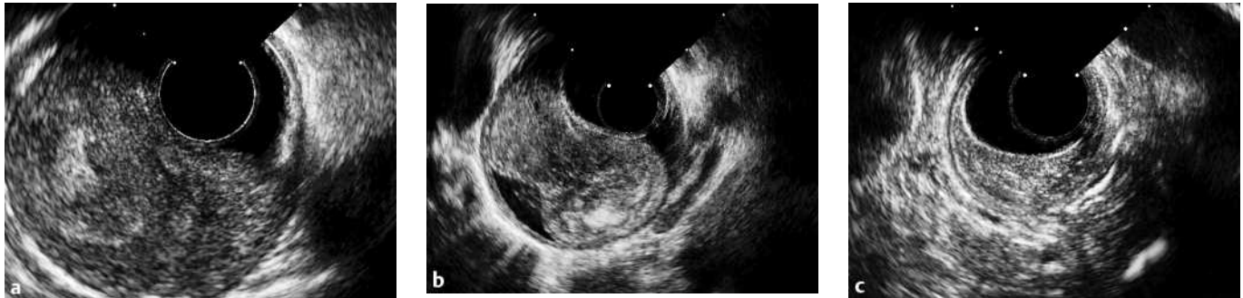
Figure 1 Endoscopic ultrasonography (EUS) of the esophageal liposarcoma. a The aboral segment, with regular layers in the esophageal wall; air is visible between the tumor and esophageal wall, indicating a tumor peduncle. b The middle third after the esophageal lumen has

been filled with water, completely surrounding the tumor peduncle and showing a tumor waist. c The base near the pharyngoesophageal junction, with thickening of the wall and a hyperechoic structure with intact layers (no evidence of malignant tumor growth).