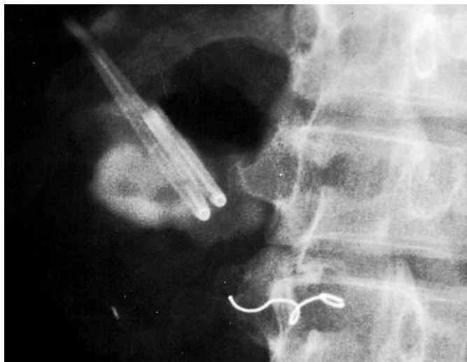
Figure 3 The coil has reached its final shape within the end of the main pancreatic duct. The coil is obstructing the ductal leak.