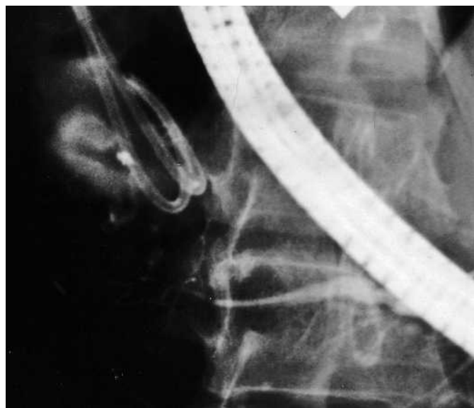
Figure 1 Endoscopic retrograde pancreatography, showing a poorly defined leak in the pancreatic tail region following a left-sided pancreatic resection. The leaking contrast is accumulating in the cyst lumen, which is already being drained with two double-pigtail catheters.