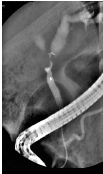
Figure 2 Endoscopic retrograde cholangiopancreatography image showing a Bismuth type III hilar stricture.