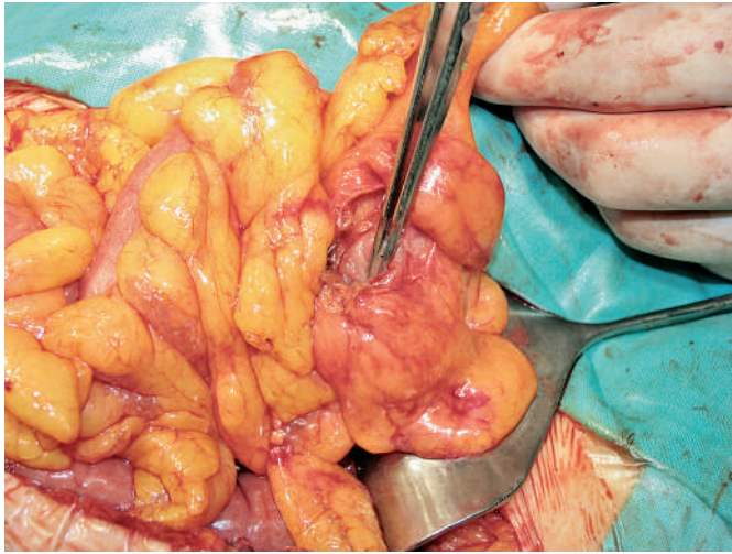
Figure 3 Sigmoid iatrogenic perforation within epiploic appendix visible after opening the visceral peritoneum.