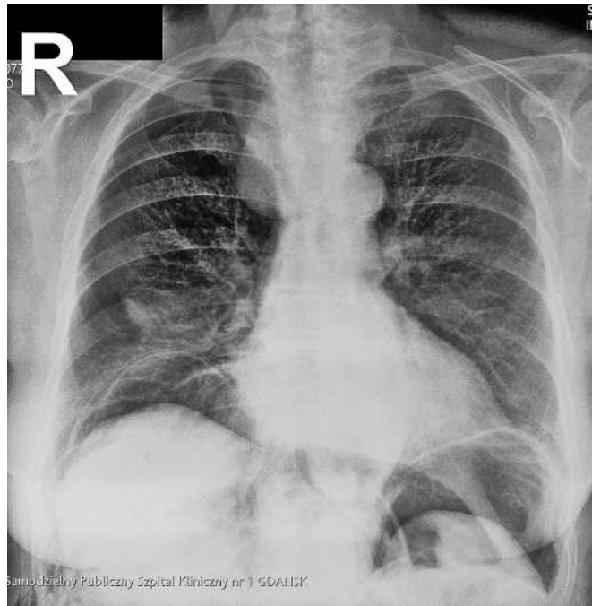
Figure 1 Plain chest radiogram. Right pneumothorax and free air below diaphragm on both sides.

Pneumothorax and intestinal pneumatosis may accompany colon perforation and are relatively rare [1–5]. Usually, chest pain or clinical deterioration of an older patient is considered acute myocardial ischemia. Although myocardial infarction develops in only 0.12% of endoscopies in the general population [3], the number rises to 16% in patients with severe coronary heart disease [4]. In our case, acute chest symptoms were the manifestation of iatrogenic perforation of the sigmoid.