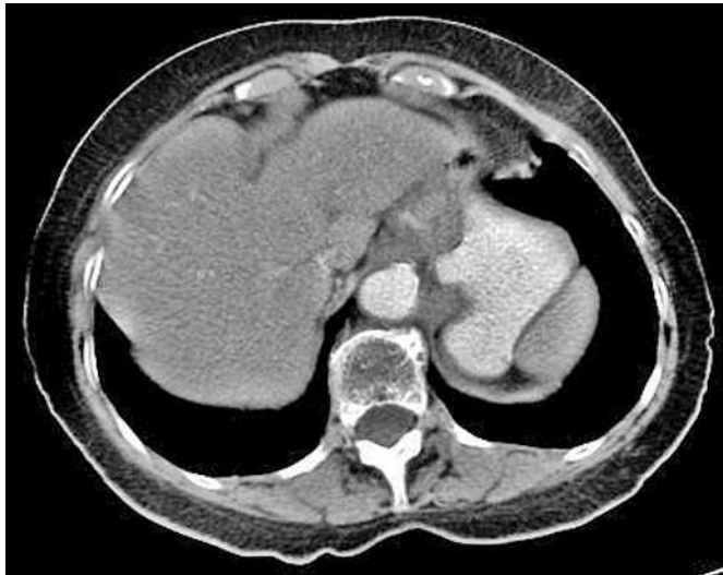
Figure 3 Computed tomographic view showing an intraluminal polypoid mass.

acterized by an interruption of the muscularis mucosae caused by an erosion of the gastric mucosa in chronic gastritis or ischemia: there is elongation of the gastric foveolae and hyperplasia and cystic dilatation of the gastric glands, extending into the submucosal layers [3]. In an operated stomach, the effects of surgery or the presence of suture material could allow epithelial elements to migrate into the submucosa. Gastritis cystica profunda may present as giant gastric folds, as a submucosal tumor, or as an isolated polyp [4]. Endoscopic ultrasound shows an echo-poor, multilocular cystic mass in the thickened submucosal layer. Gastritis