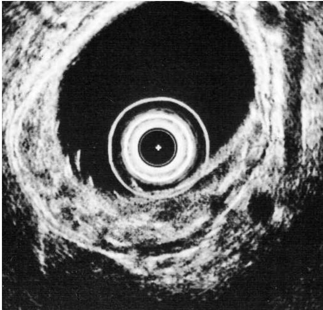
Figure 4 Endoscopic ultrasound view of a giant fold in the fundus, showing multiple anechoic areas in the thickened submucosal layer.