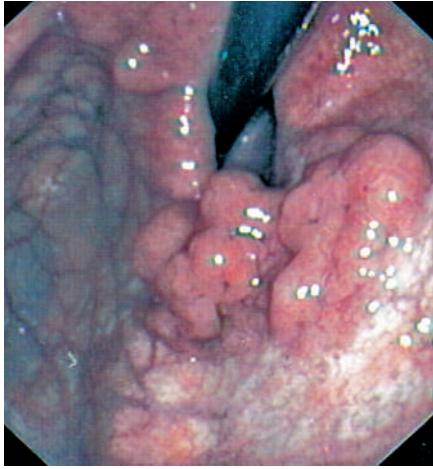
Figure 1 Gastroscopic view showing giant folds along the anterior wall of the fundus.

A 79-year-old woman was admitted because of intermittent epigastric pain. She had no history of gastrectomy or gastroenterostomy. Gastroscopy revealed giant gastric folds along the anterior wall of the fundus (Figure 1). A partial mucosectomy of the lesion showed dilated cystic glands in the basal portion of mucosa, extending to the submucosa through an interruption of the muscularis mucosae (Figure 2). No dysplastic changes were observed. Contrast-enhanced abdominal computed tomography revealed an intraluminal polypoid mass with a thick peripheral wall (Figure 3). Endoscopic ultrasound showed a thickened, echo-poor submucosal layer containing multiple anechogenic areas, indicating the presence of submucosal cysts (Figure 4). These findings were consistent with gastritis cystica profunda. Because of the age of the patient, no surgical resection was performed. A follow-up gastroscopy 3 months after the initial examination showed no macroscopic changes.