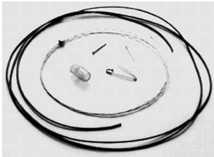
Figure 1 The ferromagnetic foreign body-retrieval instrument, showing the Teflon sleeve, the ligator cylinder, and examples of the sharp foreign bodies removed.

Metallic foreign bodies have been removed under fluoroscopic control but this can be hazardous [1,2]. We describe here an endoscopic method for removal of sharp metallic foreign bodies using a magnetic retrieval instrument we designed ourselves.