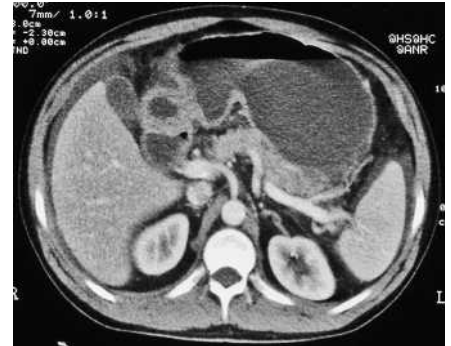
Figure 3 Contrast-enhanced abdominal computed tomographic view (using intravenous and oral contrast) showing pronounced contrast enhancement with gastric ectasia, thickening of the antrum and the second part of the duodenum, and ascites.

A. Tursi 1 , G. Rella 2 , C. D. Inchingolo 2 , M. Maiorano 3