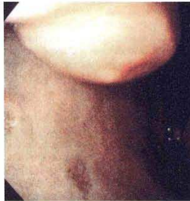
Figure 1: Endoscopic image of a submucosal lesion, measuring 3 cm, identified as a polypoid tumor with a wide base on the anterior side of the duodenum.