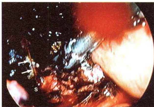
Figure 2: Pulsatile bleeding (arrows) was starting again as coagulated blood was removed from around the cystic duct. S: The stump of the cystic duct.

BP Blood pressure Hb Hemoglobin LCE Laparoscopic cholecystectomy PR Pulse rate Re-lapa. Laparoscopic reintervention