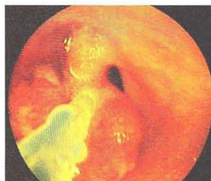
Figure 2: Endoscopic view of the ileal polypectomy.