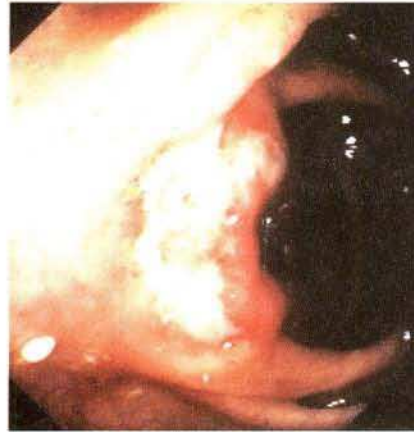
Figure 1: The first colonoscopy. There is ulceration at the ileocecal valve.