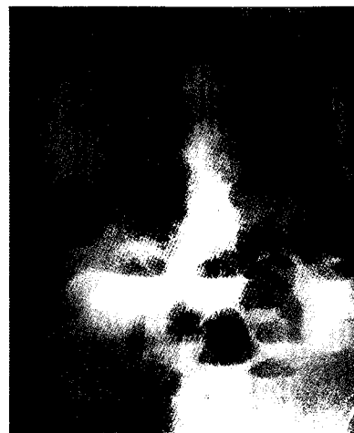
Figure 2: During lavage, the patient developed an intestinal obstruction. The plain abdominal radiograph shows air-fluid levels in dilated small intestinal loops.