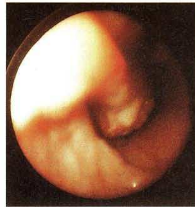
Figure 1: Endoscopic appearance of the polyp in the lower third of the esophagus.

1 Institute of Anatomic Pathology, University of Trieste, Trieste, Italy; 2 Department of Hematology, University of Udine, Udine, Italy; 3 Department of Gastroenterology, U.S.L. No. 1 – Triestina, Trieste, Italy