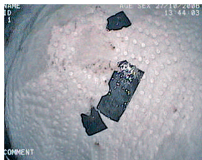
Figure 3 The foreign material removed from the patient's stomach.