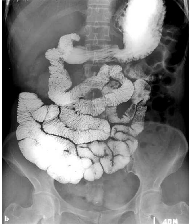
Figure 2 a Endoscopic view of an edematous and ulcerated stalk stump at the duodenal bulb. b The follow-up small-bowel series showed no evidence of the previously noted polypoid mass.