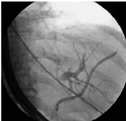
Fig. 1 Guide wire inside the stent from the flap-hole.