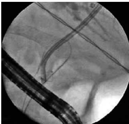
Fig. 2 Snare catching the biliary stent.