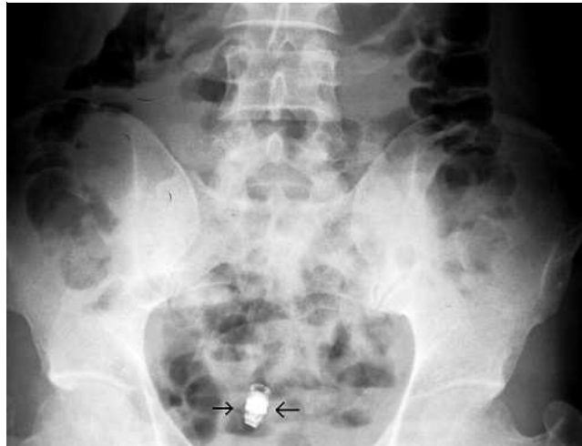
Fig. 2 Retained capsule as seen in abdominal plain X-ray film.