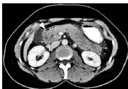
Fig. 2 A contrast-enhanced computed tomographic image showing edema of the pancreas and a small fluid collection around the pancreatic head (arrowhead).

A 43-year-old woman with familial adenomatous polyposis underwent esophagogastroduodenoscopy for ablation of multiple duodenal adenomatous polyps (► Fig. 1 ) using intermittent pulses of APC (30 W) (Erbe, Tübingen, Germany). During one ablation a short submucosal gas injection occurred and this was perceived by the patient as a brief episode of pain that resolved spontaneously. Six hours after the procedure the patient developed epigastric pain and a slightly tense upper abdomen. Computed tomography performed approximately 12 hours after the procedure revealed edematous