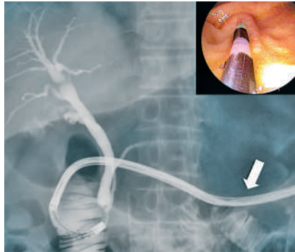
Fig. 1 Cholangiopancreatography was performed using an ultrathin transnasal endoscope in patient 1. Note that the scope was inserted through the gastric stoma (arrow). Inset: Endoscopic view of the papilla of Vater.

Because a transoral or transnasal approach is essential to the performance of endoscopic retrograde cholangiopancreatography (ERCP) [1], difficulties are often encountered in complicated cases when either approach is problematic, including in patients who have suffered a cerebrovascular accident. In such patients percutaneous endoscopic gastrostomy (PEG) has often previously been carried out for long-term nutritional management. Here we describe the successful performance of ERCP through the gastric stoma using an ultrathin forward-viewing endoscope (EG530N5; Fujinon-Toshiba, Tokyo, Japan).